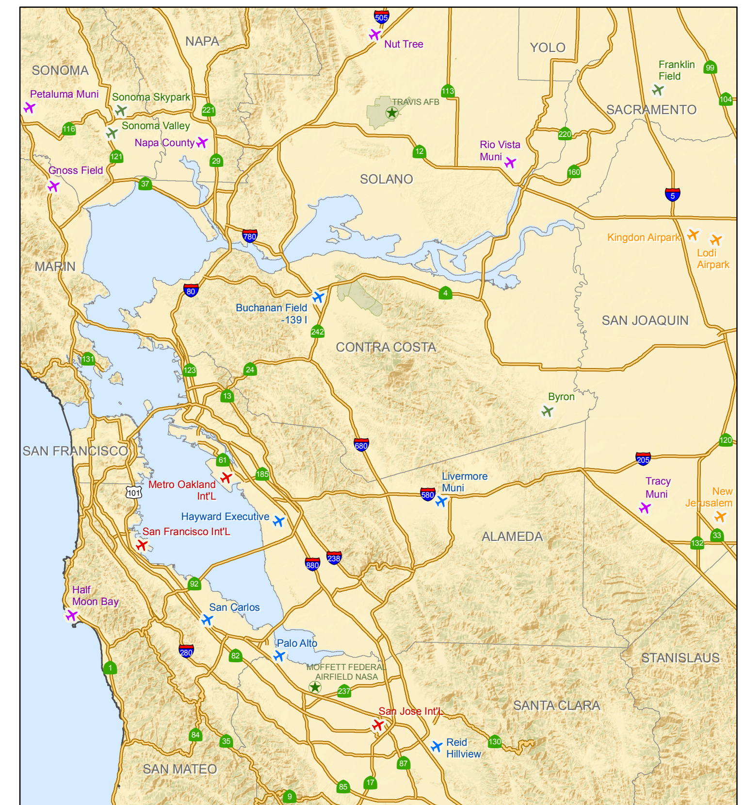
San Francisco Bay Area

DISCLAIMER: The State of California, the California Department of Transportation, and the Division of Aeronautics make no representations or warranties regarding the accuracy of the data from which these maps were derived. Neither the State nor the Department shall be liable under any circumstances for any direct, indirect, special, incidental, or consequential damages with respect to any claim by any third party on account of or arising from the use of this map.