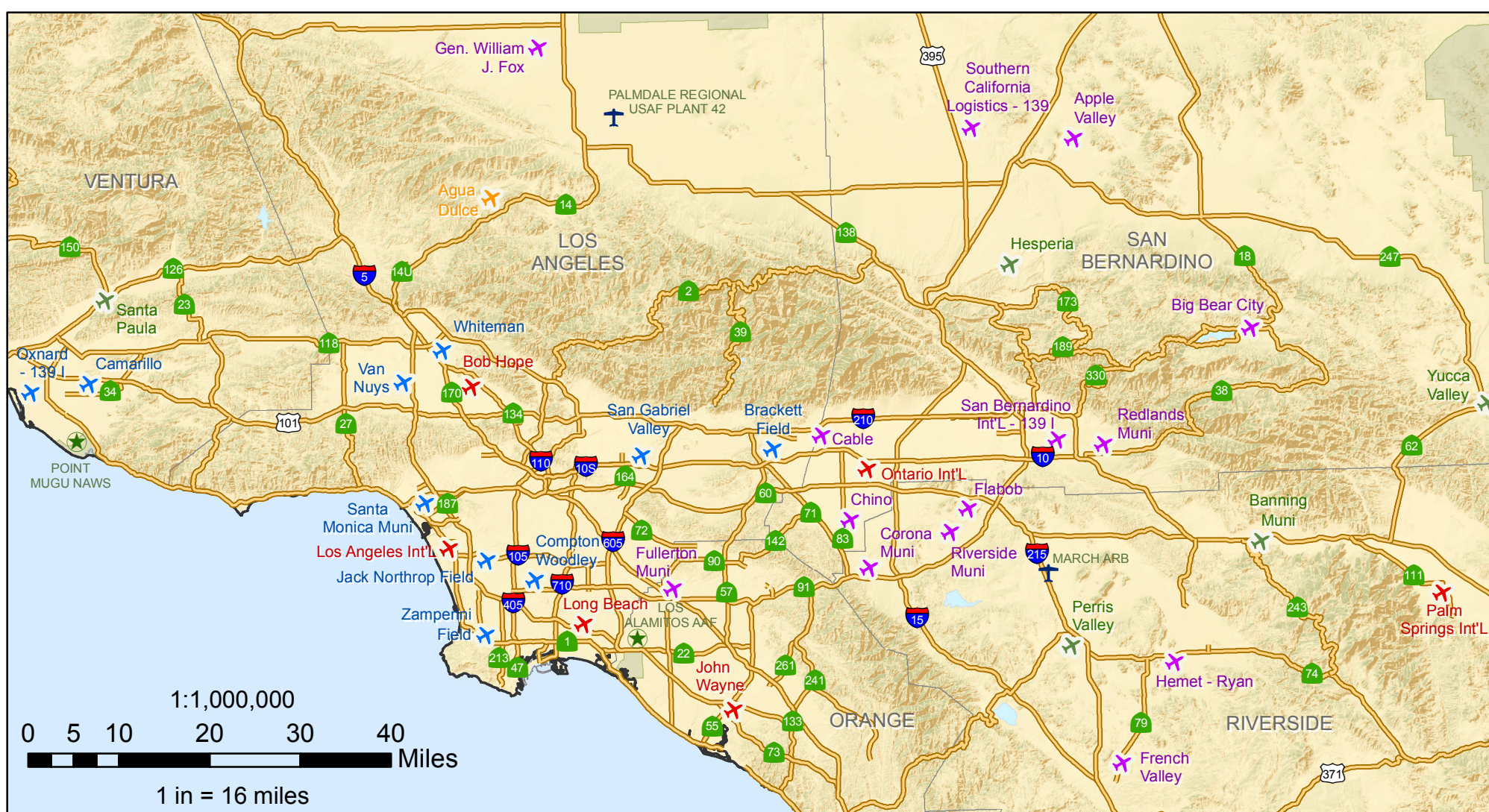
Los Angeles Area

1:1,000,000 0 5 10 20 30 40 Miles 1 in = 16 miles